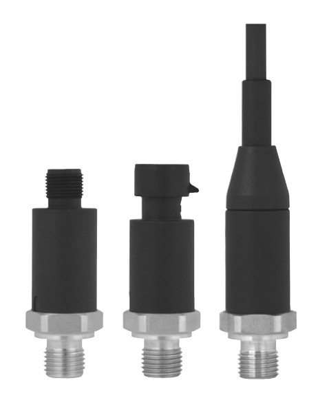
Pressure transmitter model OT-1