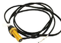
Magnetic Pick-up Sensor