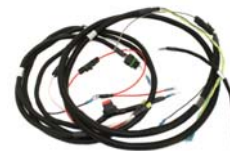
Wiring Harness Kit

** unless using alternator signal; contact factory for additional Mag Pick-up options