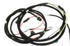
Wiring Harness Kit

* for 12V ISE and pneumatic systems only ** unless using alternator signal; contact factory for additional Mag Pick-up options