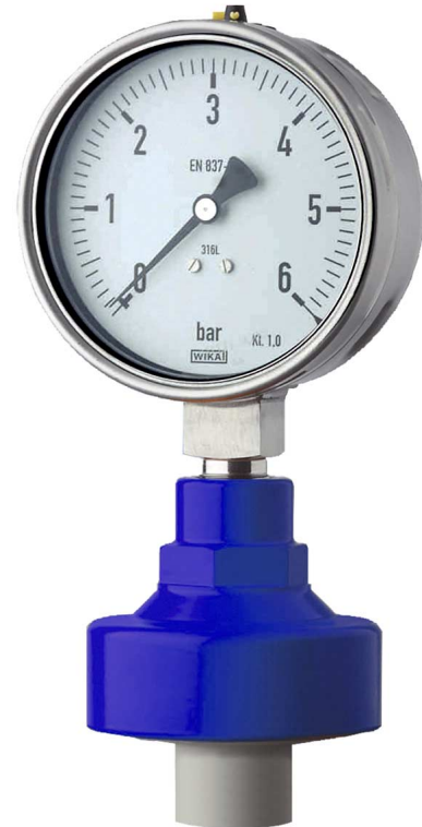
Diaphragm Seal, Threaded Process Connection, Plastic Design Model 990.31 with Pressure Gauge Model 232.50 NS 100