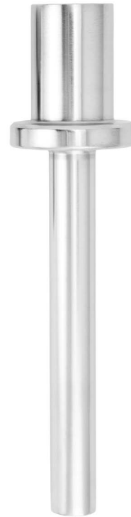
Thermowell for lap flanges, model TW30