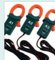
Model PQ34-12 1200A Current Clamp Probes with 2" (50mm) jaw opening