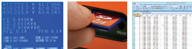
Backlit LCD displays numerical values. The data can be stored in SD memory card (included) and then transferred from meter to PC using Excel ® software and datalogged readings.

Complete with 4 voltage leads with alligator clips, 8 AA batteries, SD memory card, Universal AC adaptor (100 to 240V), and case. Clamp probes sold separately.