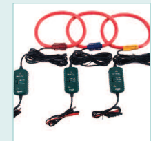
Model PQ34-30 3000A (24"/600mm) Flexible Current Clamp Probes for wrapping around busbars