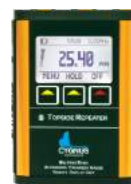
Upgrade Kit A

Unbiblical cable length is specified by the customer up to a maximum of 1,000 m (3,280 ft).