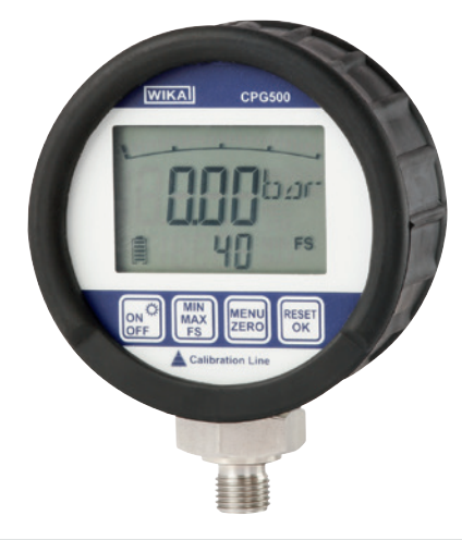
Digital pressure gauge model CPG500